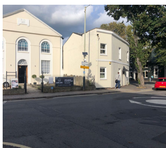
Chapel Arts Roundabout