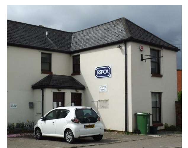
Alleyene Lodges, RSPCA & Essential Space - Unit A

Parking can be found on the surrounding streets, all are between 1 to 3 minutes walk. Some have payment metres and the option to pay using the MIPERMIT app, the location number on St James Square is 705652. St James, also has a public car park where you can park for a longer period of time.