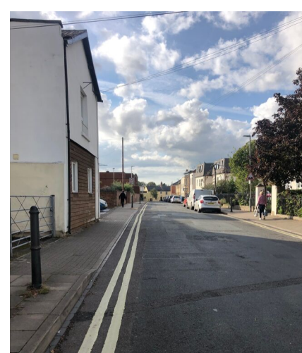
Entering into Knapp Road